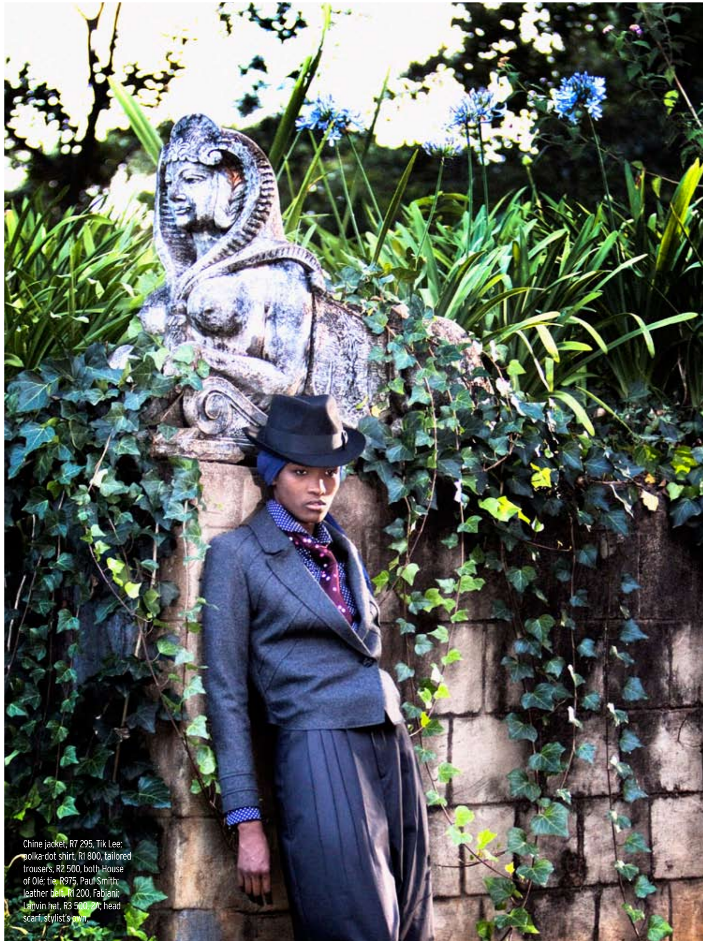
Chine jacket, R7 295, Tik Lee; polka-dot shirt, R1 800, tailored trousers, R2 500, both House of Olé; tie, R975, Paul Smith; leather belt, R1 200, Fabiani; Lanvin hat, R3 500, 2A; head scarf, stylist's own.