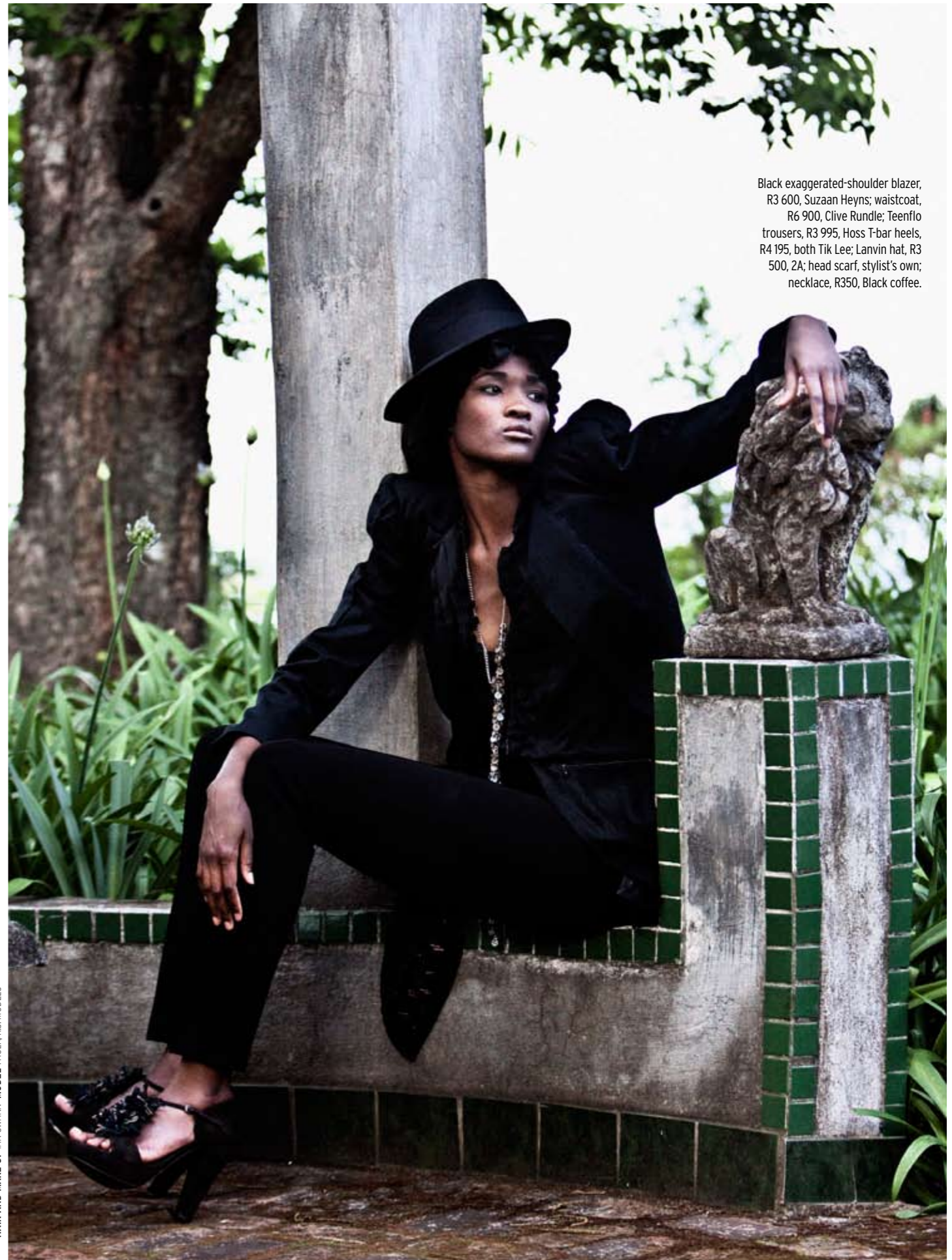
Black exaggerated-shoulder blazer, R3 600, Suzaan Heyns; waistcoat, R6 900, Clive Rundle; Teenflo trousers, R3 995, Hoss T-bar heels, R4 195, both Tik Lee; Lanvin hat, R3 500, 2A; head scarf, stylist's own; necklace, R350, Black coffee.