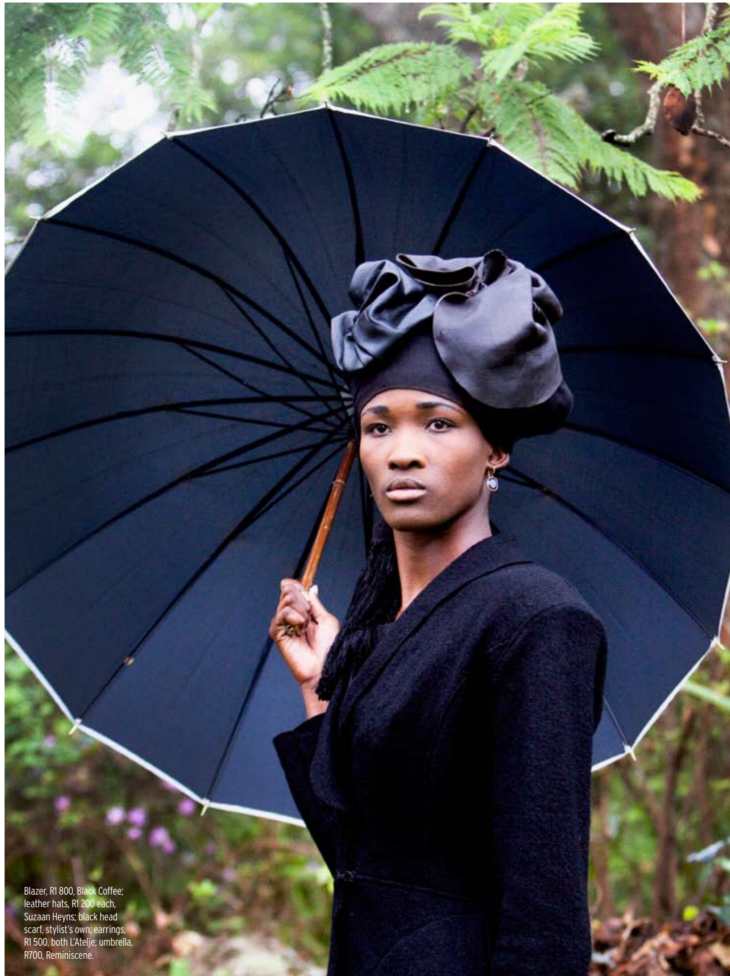
Blazer, R1 800, Black Coffee; leather hats, R1 200 each, Suzaan Heyns; black head scarf, stylist's own; earrings, R1 500, both L'Atelje; umbrella, R700, Reminiscene.